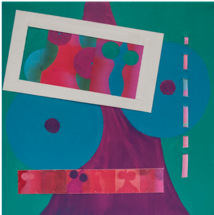
Title: Moments Captured, Moments Lived Medium: Acrylic and inkjet on canvas Size: 12 x 12 inches