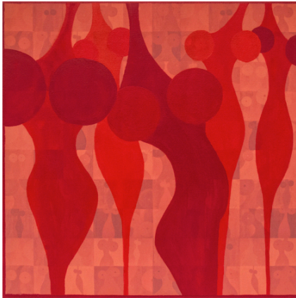
Title: Vive La Dialectic Medium: Acrylic and inkjet on canvas Size: 12 x 12 inches